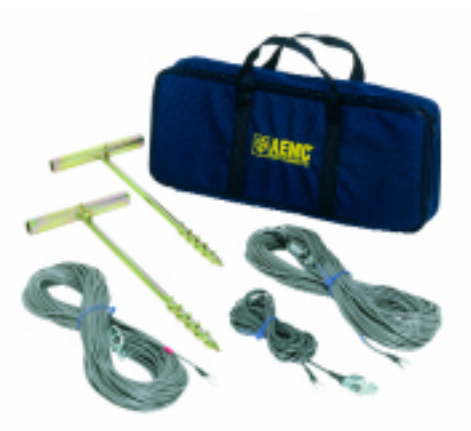
Ground Test Kit – 3-Point (supplemental 4-Point) includes carrying bag, two 100 ft color-coded leads, one 16 ft lead and two 16" auxiliary ground electrodes Catalog #2130.61

Test Kit – 3-Point includes carrying bag, two 150 ft color-coded leads on spools, two 16" auxiliary ground electrodes, one 16 ft lead with Mueller® clip and one 100 ft tape measure Catalog #2130.62